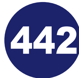
Total District Cases (since 9/1/20)

Total = total number of active & recovered cases from the start of school.