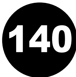
Recovered Staff Cases