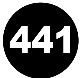
Recovered Total Cases

Recovered = individuals who are no longer sick.