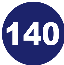
Total Staff Cases (since 9/1/20)