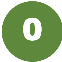
Active Staff Cases