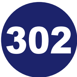
Total Student Cases (since 9/1/20)

Recovered = individuals who are no longer sick.