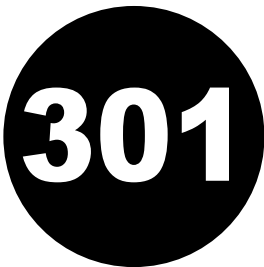
Recovered Student Cases

Active = individuals who are confirmed positive and currently in the isolation protocol.